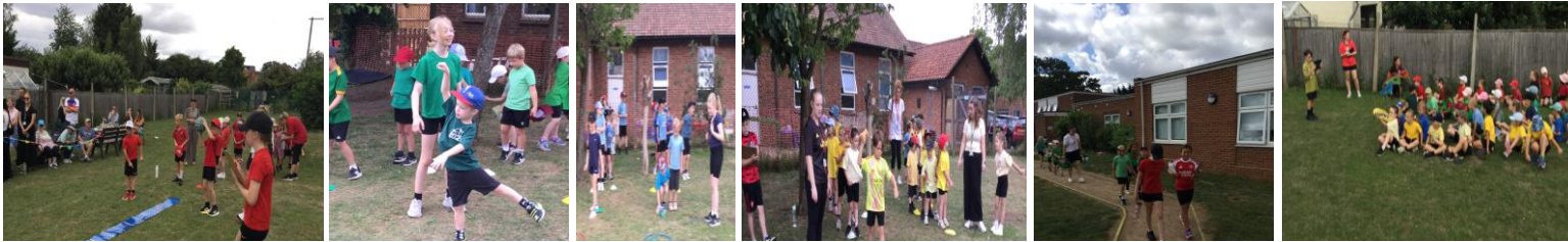
Sports day 2026

Thank you to everyone who came to cheer on our lovely children at Sports Day.